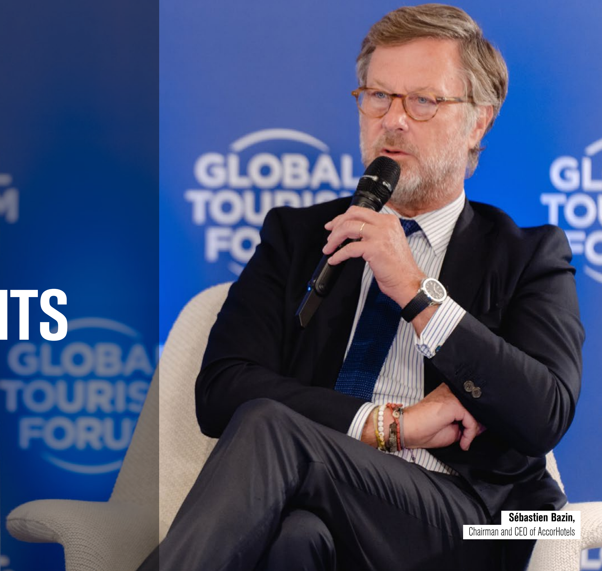
Sébastien Bazin, Chairman and CEO of AccorHotels