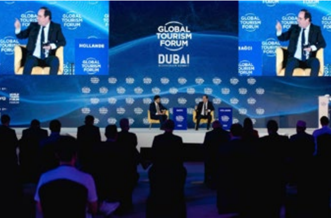
François Holande, former president of france suggested that blockchain technology could be used to facilitate transportation, simplify procedures, and enhance transparency and security for travelers and destination countries.