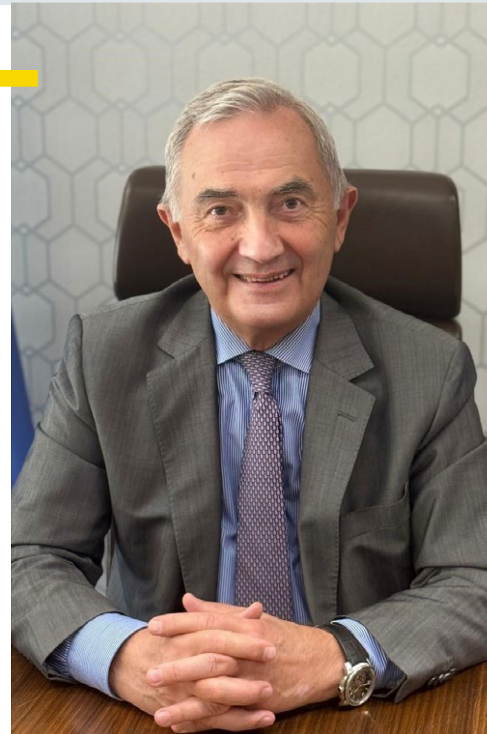
AMBASSADOR LAZAR COMANESCU, the Secretary General of the Permanent International Secretariat (PERMIS) of the Organization of the Black Sea Economic Cooperation (BSEC),

A Developing and diversifying touristic activities and services is of particular importance and constitutes a priority for BSEC. That includes, for example, development of cultural routes and of thematic tourism, including cultural and gastronomic festivals. All that requires the availability of appropriately qualified human resources, respectively the implementation of specific training programs and projects. It is in this context that a First Meeting of Higher Education Institutions Specialized in Tourism Education in the BSEC region, was held in Baku on 23 April 2024, where strategies to provide guidance for the future of tourism in the wider Black Sea region were extensively discussed. Tourism development nevertheless cannot be successfully promoted without resilient transport infrastructure and high-quality, safe and secure mobility services. To this end and in more general terms, to face challenges in this area including, for example, border crossings, BSEC closely cooperates with regional and sectoral organizations such as UNECE, IRU, ITF, etc.