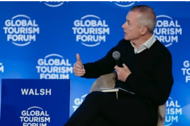
Willie Walsh, Director General IATA has discussed the critical role air cargo played during the pandemic, acting as a lifeline for vaccines, supply chains, and airline revenues.