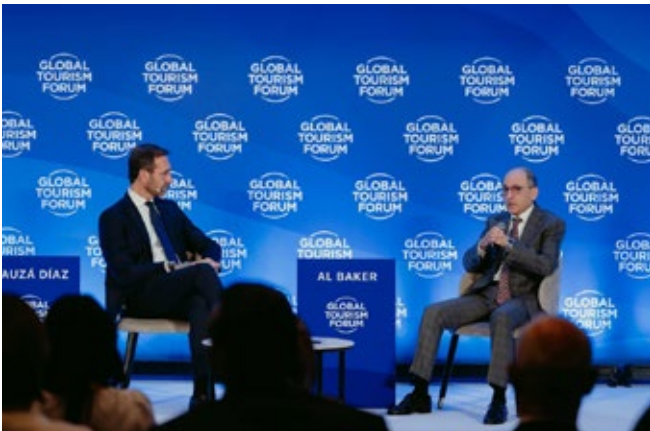
One of the highlights of the GTF was a special one-on-one conversation about the impact of the FIFA World Cup on tourism with special guest His Excellency Akbar Al Baker, Chairman of Qatar Tourism and Group Chief Executive of Qatar Airways.