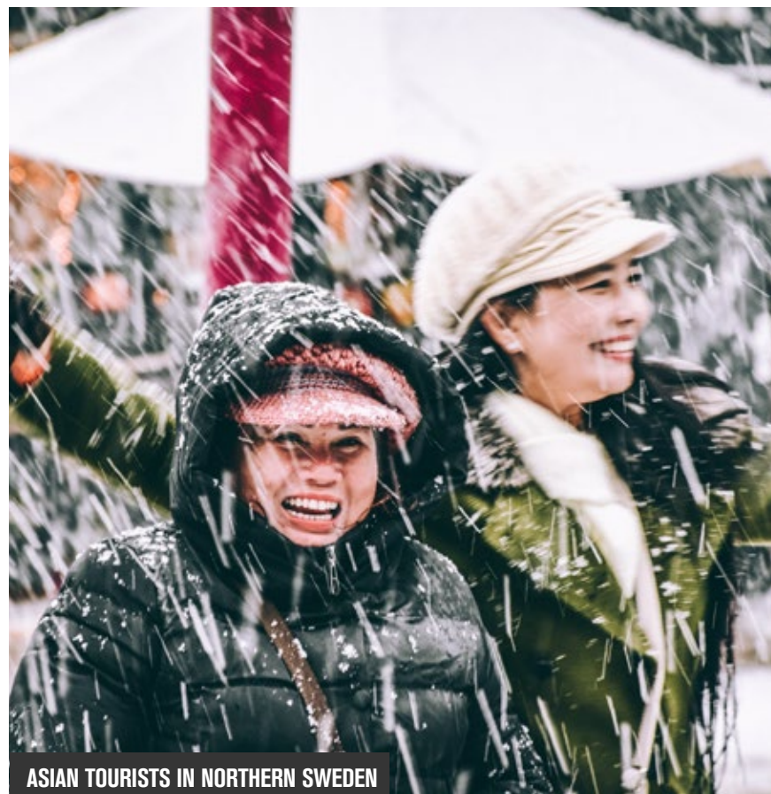
ASIAN TOURISTS IN NORTHERN SWEDEN