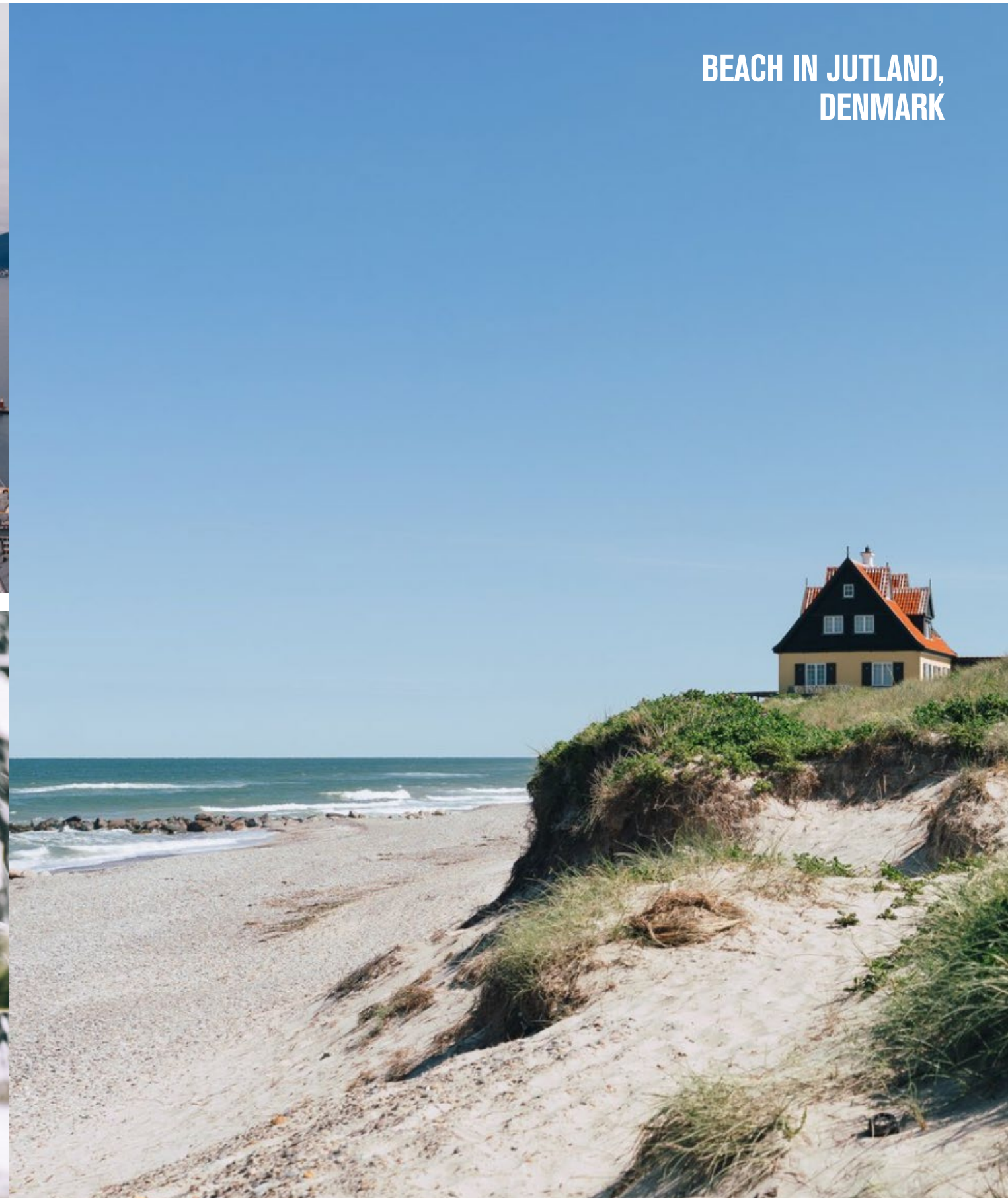
BEACH IN JUTLAND, DENMARK