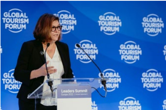
Transportation and tourism go hand in hand, and without efficient transport, the tourism industry can suffer. Adina-Iona Valean, the European Commissioner for Transport, emphasized this point during her keynote speech at the GTF Leaders Summit Europe 2022 in Brussels.